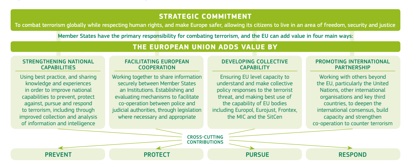
Figure 1: EU counter-terrorism strategy

There have been several developments in the field of counter-terrorism over the past two decades, to strengthen the EU response in the face of attacks. In 2005, the EU launched its Counter-Terrorism Strategy, which comprises four essential pillars for reducing the risk from terrorism on a sustainable basis: Prevent, Pursue, Protect and Respond.<sup>39</sup> Adopted by the Council of the EU in November 2005, this is the major statement of the EU's policy and approach. 40 Building on prescriptions outlined in the 2004 European Council Declaration on Combating Terrorism, which recommended heightening, enhancing and better integrating counter-terrorism objectives into external assistance programmes.41